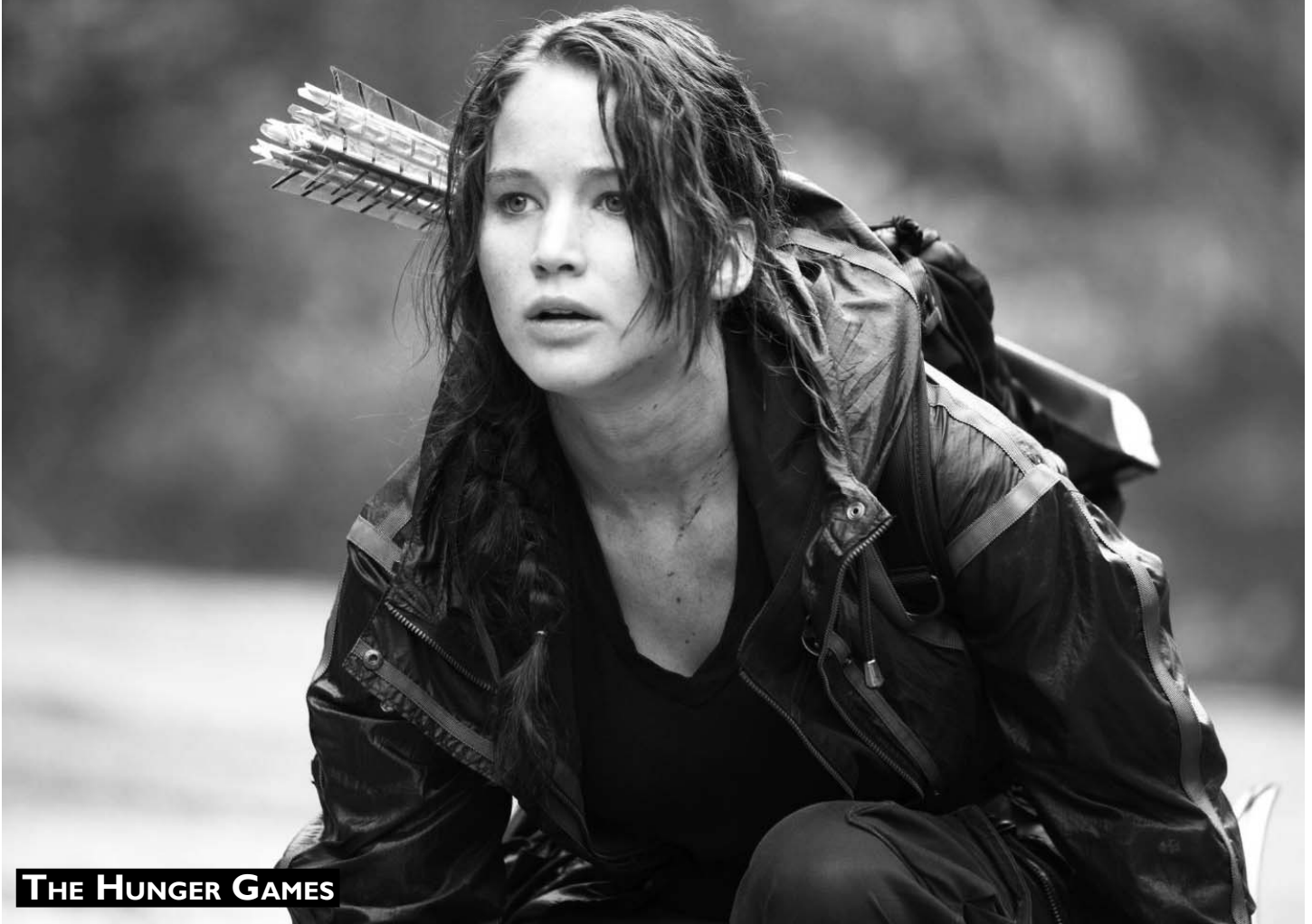
THE HUNGER GAMES